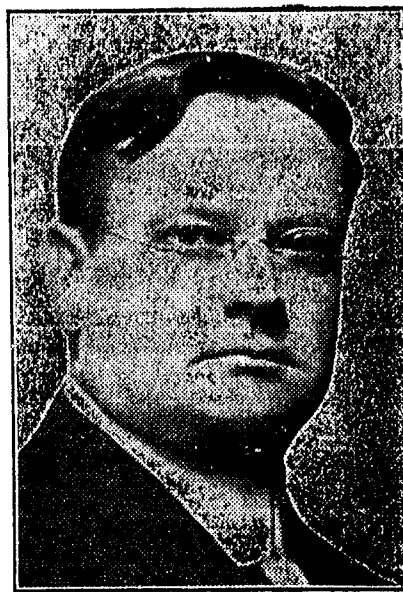
Governor Hiram W. Johnson