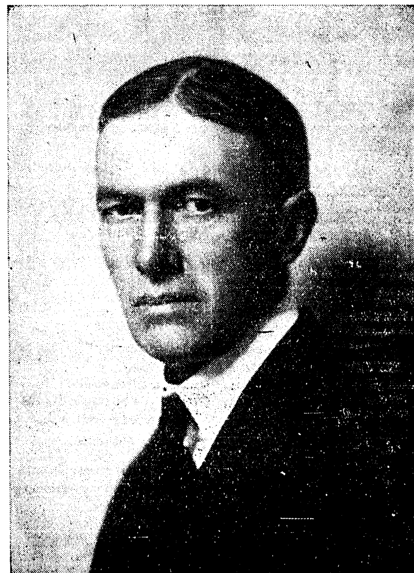
Congress William Kent

For Sale—Black and red seed oats and baled straw. Phone Rural 659. 19.